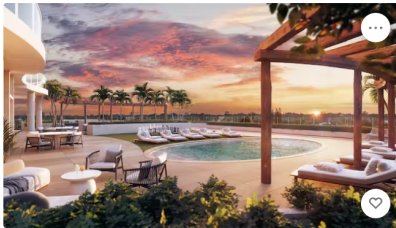
Alba Palm Beach Sunset Pool Deck