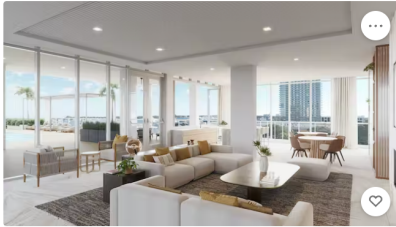
Alba Palm Beach Owner's Lounge