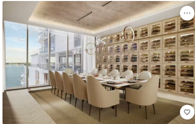
Alba Palm Beach Private Wine and Dining Room