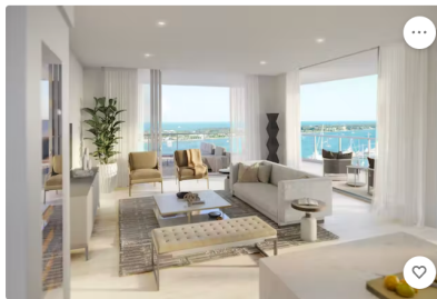
Alba Palm Beach Living Room