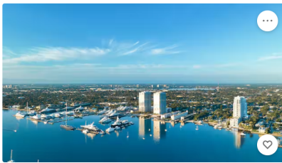
Alba Palm Beach from the Water