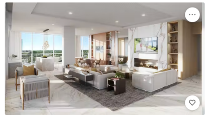
Alba Palm Beach Owner's Lounge