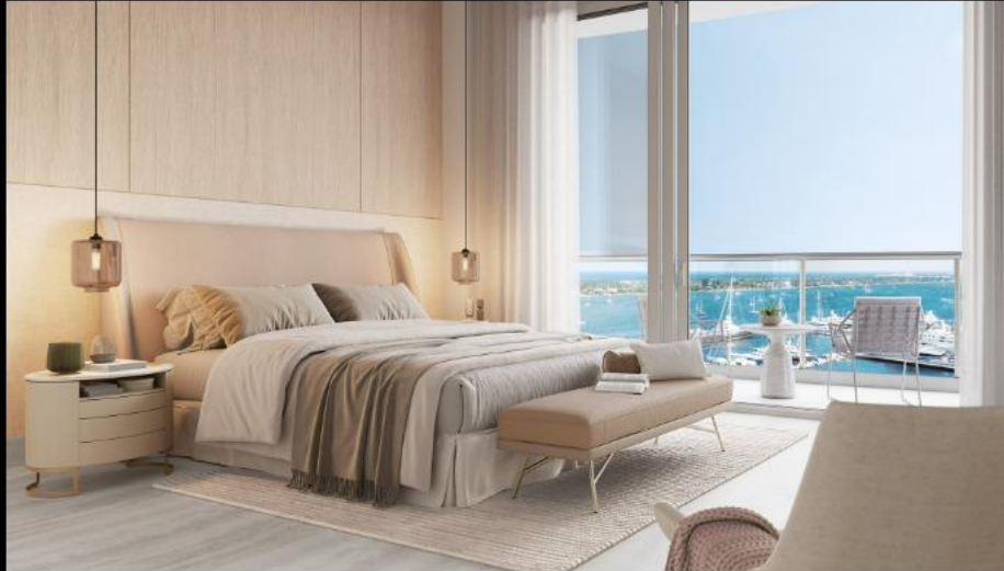
A bedroom in a residence at Alba Palm Beach in West Palm Beach, Florida.