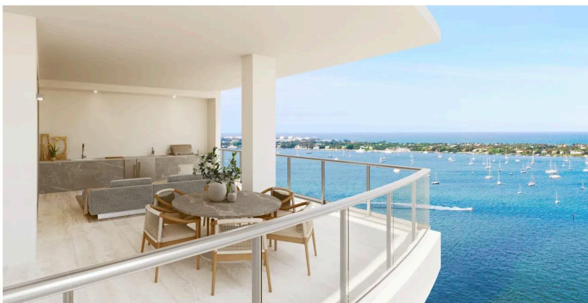
A rendering of a terrace view from the luxury condominium Alba Palm Beach in West Palm Beach, which has units starting at less than $3 million. It is slated open in 2025. Alba Palm Beach

A pandemic-motivated population surge in Florida that began in 2020 may have since slowed, but Realtors said there is still a steady migration of new residents as wealthy buyers leave high-tax states such as California and New York.